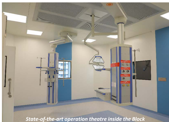
State-of-the-art operation theatre inside the Block